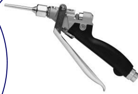
Pistol grip tip-seal flow gun